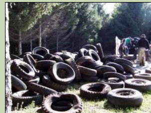
Larson and volunteers (left) load up old tires from Point Creek Natural Area in an environmental clean-up project.

lay abandoned for years on this Lake Michigan shoreline property, now known as Point Creek Natural Area (PCNA) since its purchase in 2001. The Point Creek site, located in the Town of Centerville, is a research and educational area with public passive recreation that has been undergoing work to restore it back to a habitat of mixed native species.