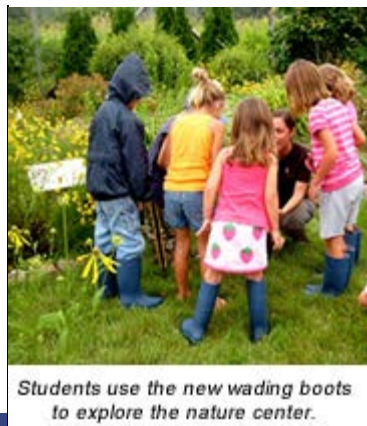
Students use the new wading boots to explore the nature center.

also purchased for the Water Wonders program, allowing each student an opportunity to hike through the marsh and search for macro-invertebrates in the pond. Kelly added, "Teachers and students were thrilled to have this unforgettable experience."