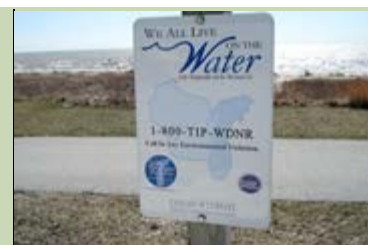
This sign sponsored by Cassiani and Company along the Lake Michigan Shoreline in Two Rivers